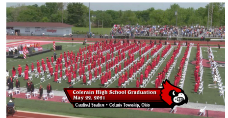
Colerain High School Graduation