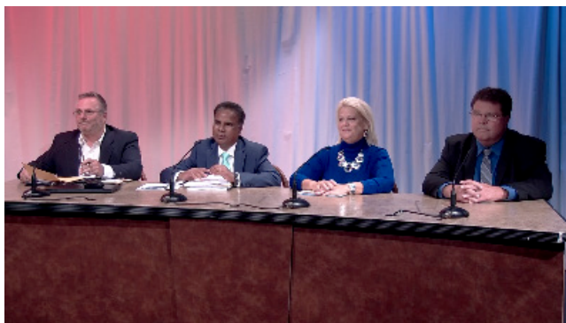
Waycross Election Forum: Colerain Township Trustee

In addition, Waycross cablecast 1951 government programs produced by other agencies. These programs include: Army, Navy/Marine and Air Force News; DOD programming; NASA programming; Cincinnati City Council (Citicable); Hamilton County Commissioners (ICRC); CMHA; National Guard Anti-Drug programming; LIVE Ohio House, Senate and Supreme Court sessions; U.S. Department of Health; Ohio Dept. of Public Health and Ohio Department of Aging programming.