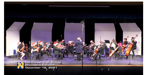
Northwest Orchestra Concert