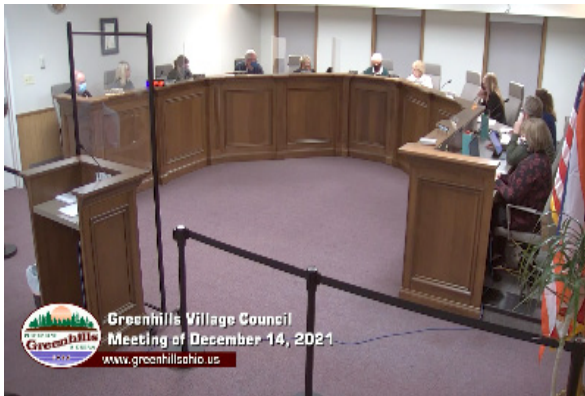
Greenhills Village Council Meeting

The Waycross Government Access Channel is operated on behalf of the governments of Forest Park, Greenhills, Springfield Township and Colerain Township. Our mission - To encourage the active participation of residents in the democratic process - is achieved through the effective use of communication tools, providing our governmental bodies with the necessary resources to educate and inform residents on the various activities and issues – local, state and federal - that ultimately impact their quality of life.