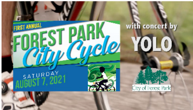
Forest Park City Cycle Event Coverage

Waycross cablecasts & streams the council and trustee meetings from our four communities LIVE, then replays them throughout the month. Waycross cablecast all general council/trustee meetings held in 2021 for our communities. In addition, Waycross recorded for playback* public hearings and zoning meetings, Winton Woods and Northwest School Board meetings, as well as the Hamilton County Public Library Board of Trustees meetings. *NOTE: Some meetings prior to July 1 were cablecast and streamed LIVE via Zoom due to Covid 19 requirements.